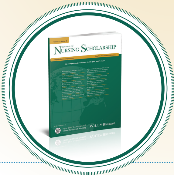
Journal of Nursing Scholarship https://mc.manuscriptcentral.com/jnu

Submitting an article to one of the STTI journals is easy. Just create an online account: